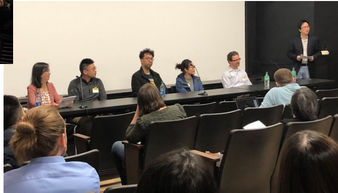
Right: Panelists discussed “Paths to Becoming a Successful Data Scientist” at the 50th Festival on April 29, 2023.